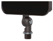
1/2" Knuckle Mount