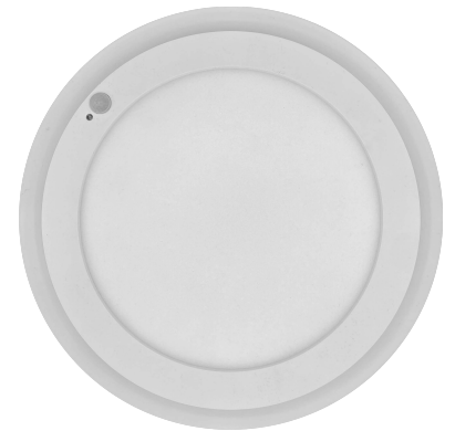
(Trim ring mounted) Extends fixture to 14"