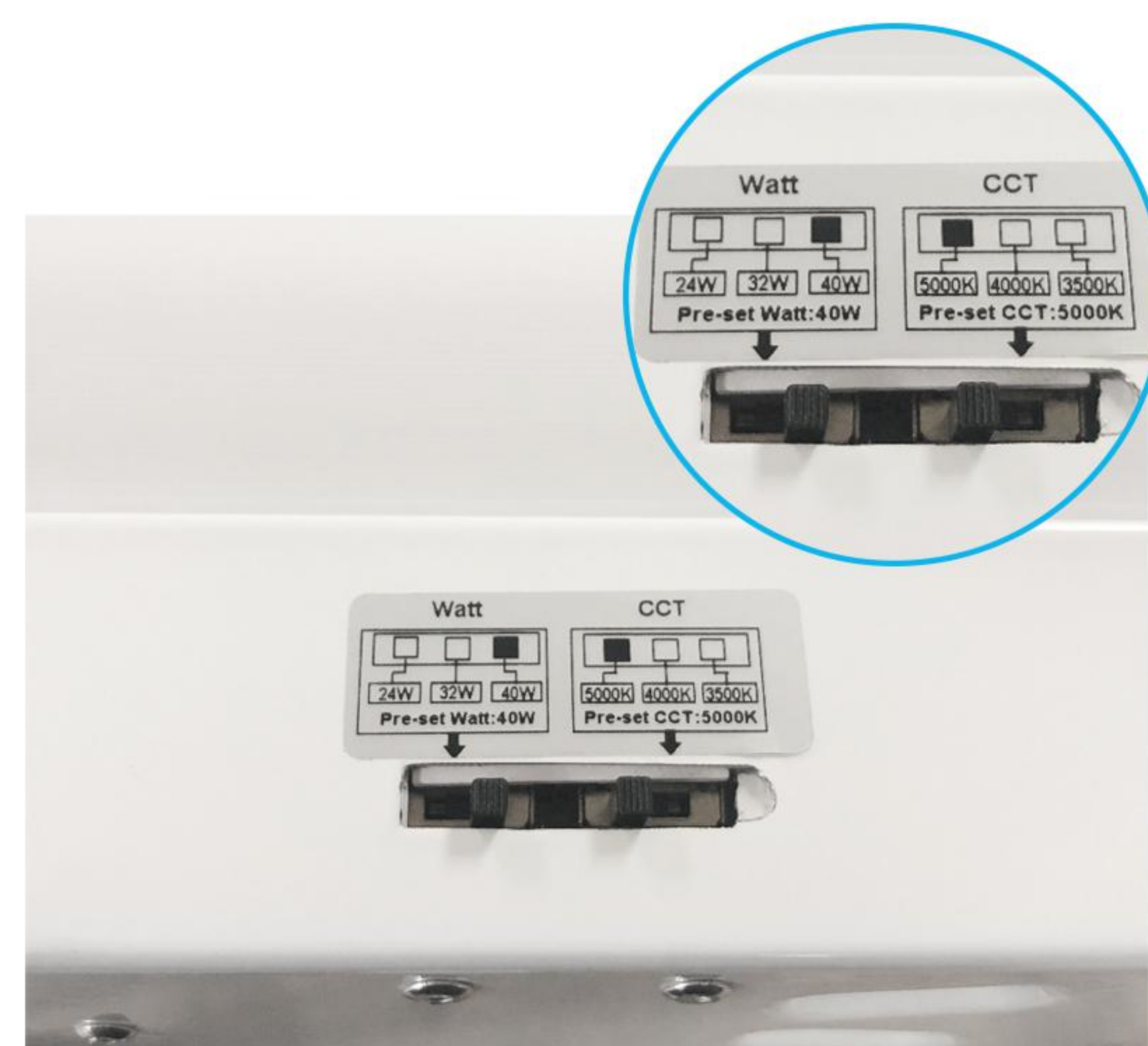
Wattage Selectable 3CCT Adjustable Technology